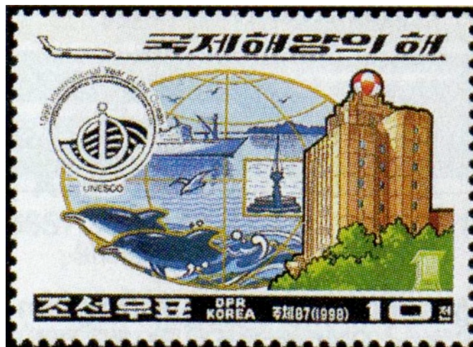
A 1998 DPRK stamp of the Hydrometeorological Service headquarters in P'yongyang.