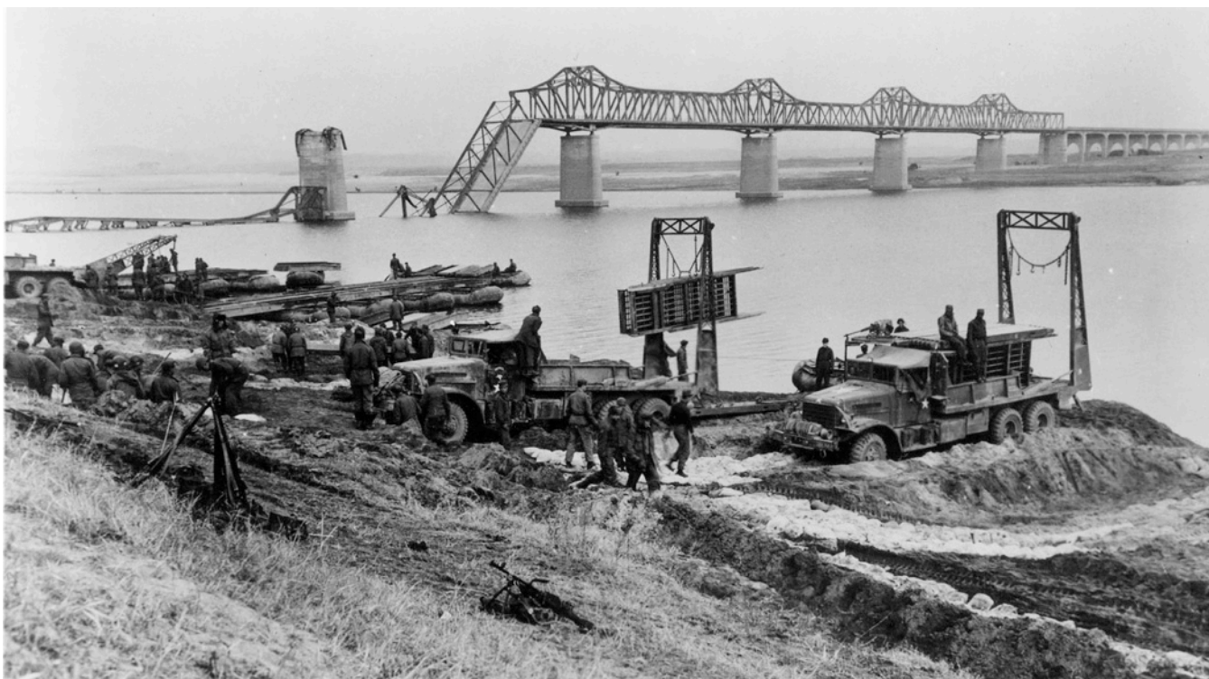
December 9, 1950, Members of the 55 th Engineer Treadway Bridge Battalion, I Corps, construct a floating bridge across the Han-gang. The western most railroad bridge is seen in the background.