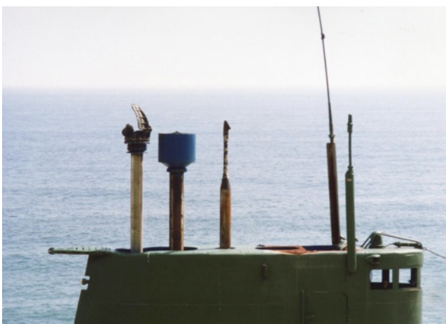
Close-up of the masts and antennas on top of the sail of the SANG-O SSC captured off Kangnung in 1996.

Regardless, during the late-1990s or early 2000s a decision was reached to design a modified version of the SANG-O SSC. Construction of the new submarine likely commenced shortly afterwards during the early to mid 2000s. A satellite image acquired by DigitalGlobe on 10 October 2005 suggests that the new submarine likely entered KPN service during or prior to 2005. This image reveals two of the new submarines—one in dry dock (39° 59' 53.69" N 128° 12' 00.04" E) at the Chunghung-man Navy Base on Mayang-do, Hamgyŏng-namdo and one at the Yuktae-dong Navy Base (40° 01' 30.78" N 128° 09' 55.38" E), Yuktae-dong, Hamgyŏng-namdo. The imagery indicates that the new 39 m x 3.8 m submarine was developed by inserting a 5 m long section aft of the sail (published sources variously report the