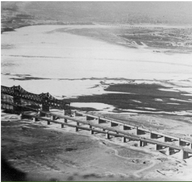
A view looking southwest, on approach to the K-16 Airfield (situated on island) of the partially repaired Han-gang rail bridges.

many readers are aware Kankō is the pre-war Japanese name for Hamhung. It was, however, also the Japanese name for the Han-gang.