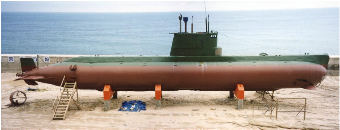
The SANG-O SSC (reconnaissance version) that was captured by the ROK off Kangnung in 1996. It is now on display above the beach where it was captured. (Joseph S. Bermudez Jr.)

superseded the ROMEO class SS as the KPN's primary submarine. 4