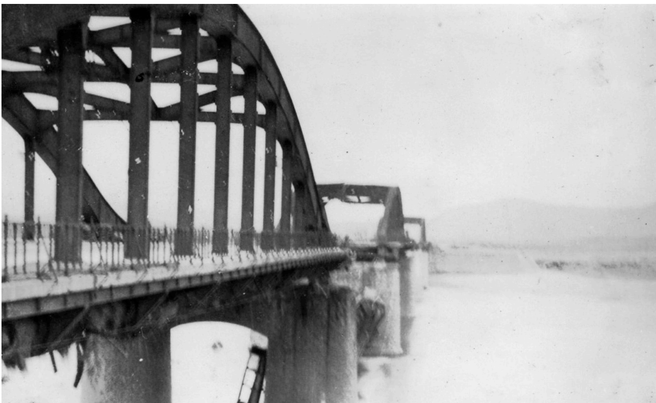
A view looking north of the road bridge over the Han-gang, taken after the recapture of Seoul.