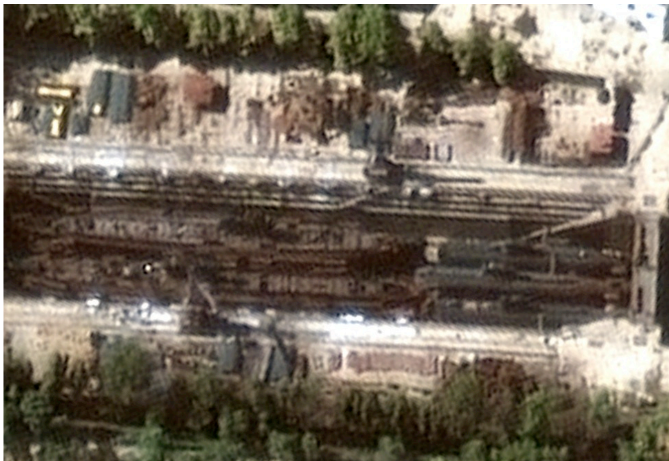
A 10 October 2005 DigitalGlobe satellite image showing a single new K-300 SSC (right center)—approximately 39 m long—berthed between two shorter 34 m SANG-O SSC in a dry dock at the Chungchung-man Navy Base on Mayang-do (i.e., Mayang Island). Two ROMEO class SS are seen deeper (left) in the dry dock.