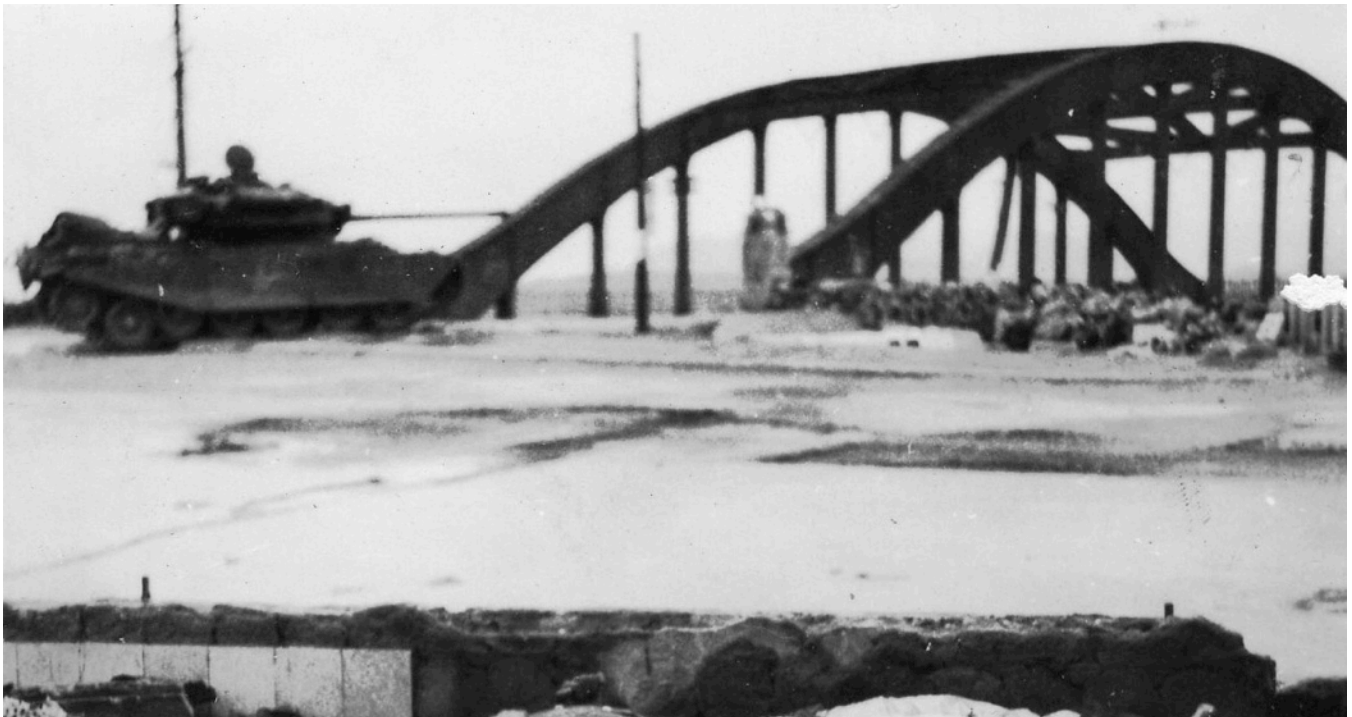
A British Centurion tank facing north at the southern end of the road bridge over the Han-gang.