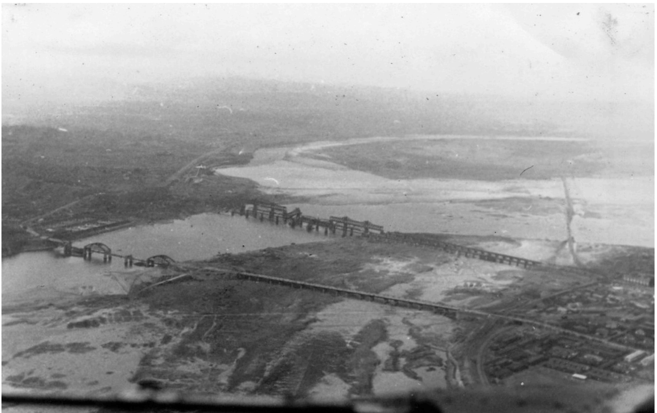
A view looking southwest, on approach to the K-16 Airfield (situated on island) of the partially repaired Han-gang bridges after the recapture of Seoul.